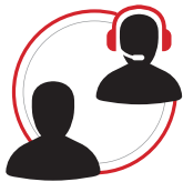
Communicating with clients

Do you find it difficult to consistently engage your participants and provide them with the advice, support and guidance they need to succeed?